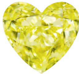
Fancy Intense Yellow