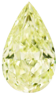
Fancy Light Yellow