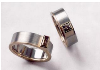
Wedding rings: 750 white and rose gold, baguettes and princess, cognac colour. © Atelier K. (Cologne)

"The key is to communicate. For me, white diamonds often create too hard of an effect. Natural Fancy Coloured Diamonds, especially champagne and cognac shades, blend more easily with different skin types."