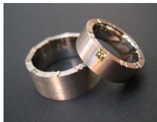
Wedding bands: 750 white gold, princess cut champagne colour. © Schmuckmanufaktur Kneist (Darmstadt)

"We appreciate the unusual character and unique diversity of colours of Natural Fancy Coloured Diamonds. Customers who place great value on individual expression like to break with tradition and opt for these extraordinary stones."