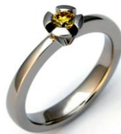
Engagement ring: 750 white gold, diamond 0.16 ct, Fancy Yellow © Rieger & Schnaas Goldschmiede (Tübingen)