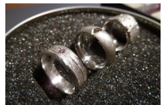
Engagement rings: "Cosy Rings" and cognac diamonds. © Gold und Form (Meersburg)