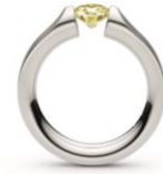
Niessing tension ring* Everest: platinum, Fancy Yellow diamond.