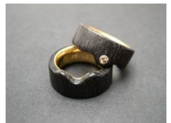
Wedding bands: 18 kt gold, ebony, Natural Fancy Coloured Diamond.