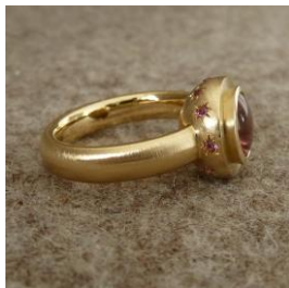
Engagement ring: 750 yellow gold, taurmaline, pink diamonds.

"I myself have a great passion for Natural Fancy Coloured Diamonds and have noticed a growing interest among my customers. Demand is increasing."