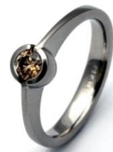
Engagement ring: 950 Palladium, diamond 0.24 ct, Fancy Brown