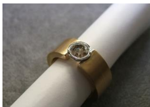
Engagement Rings: light champagne diamonds. © Goldschmiede Heike Crusius (Ratisbonne)

"Natural Fancy Coloured Diamonds make a charming and mysterious statement. For engagement rings, I like to suggest a light champagne coloured diamond as an alternative to a colourless diamond."