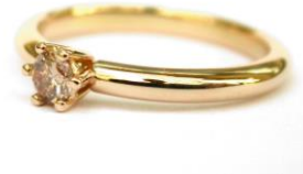
Engagement ring: pink diamond.

"Most of the time, couples want colourless diamonds for engagement rings; however, those customers who are looking for both a diamond and a touch of colour in their wedding rings are enthusiastic about the variety of colours offered by Natural Fancy Coloured Diamonds."