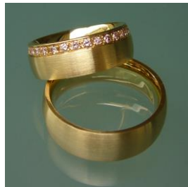
Wedding bands: 750 yellow gold, pink diamonds.