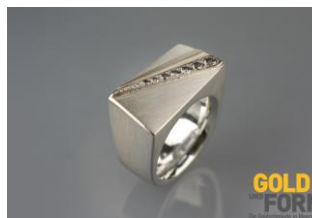
Engagement ring: silver ring with white gold and grey diamonds. © Gold und Form (Meersburg)

"Our customers are looking for something unique and they want their engagement ring and wedding bands to express that difference. The "traditional" American engagement ring, with the biggest possible diamond set on the smallest possible band, is rarely requested by our customers. Rather, they want a customized ring that fits their partner perfectly and says "you are exceptional".