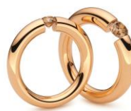
Niessing tension rings*: red gold, champagne diamonds.

"Engagement rings are definitely in fashion. We like to suggest Natural Fancy Coloured Diamonds to our customers as an alternative to colourless diamonds. For example, the warm tones of champagne diamonds blend beautifully with pink gold. Natural Fancy Coloured Diamonds have become indispensable to our range of products."