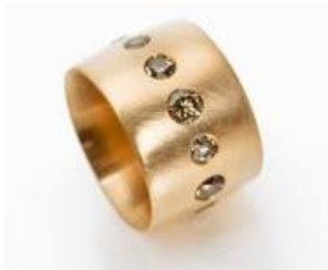
Engagement ring: 750 rose gold, champagne coloured diamonds. © Eva Niemand (Berlin)

"Eva Niemand: Longevity and inheritability are the main reasons why a couple chooses colourless diamonds, but Natural Fancy Coloured Diamonds are more than just that; they are unique, non-interchangeable pieces that blend perfectly with both the metal and the wearer."